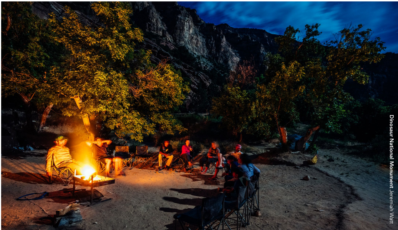
Dinosaur National Monument Jeremiah Watt

Whether you're looking for easy entry into the world of dark skies (aka astrotourism), want to discover a new or different spot, or you want to go off the beaten path, Utah offers the most options for your stargazing adventure.